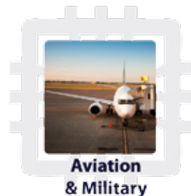
Aviation & Military

Robust features for controlling entry based upon 100% verification techniques with an accurate historical picture. Encryption and operator restriction to meet highest standards.