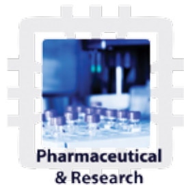
Pharmaceutical & Research

Providing a flexible platform for security and human resources management with multi-site solutions and configurable reporting features.